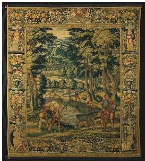
Duck hunt Wool and silk H. 200 x W. 179 cm Southern Netherlands, possibly Brussels, last quarter 16th century