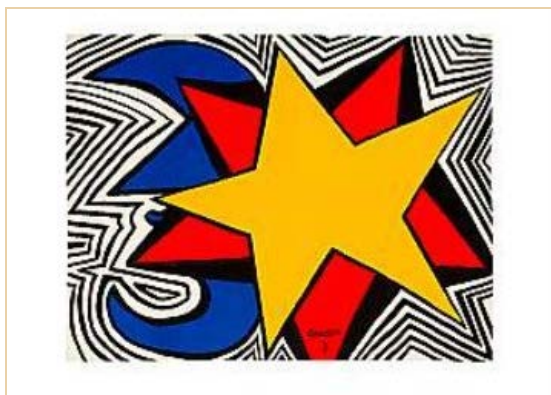
Three-color star Design cartoon by Alexander Calder (1898-1976) Pinton workshop, Aubusson, France Warp in cotton and weft in wool 150 x 202 cm Signature and workshop mark in one of the red star points 20th century, circa 1970-1972

The 54th Brussels Antiques & Fine Arts Fair (BRAFA), Belgium's oldest and most important antiques fair, will take place from Jan. 23-Feb. 1, 2009, at the Tour & Taxis site in Brussels, Belgium.