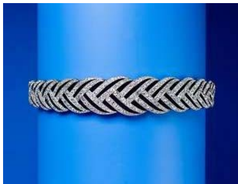
Cartier 'A garland style 'collier de chien' Set with 20 carats of diamonds, mounted in platinum, on black velvet. Can also be worn as a head ornament Signed Cartier Circa 1910 Collection Epoque Fine Jewels