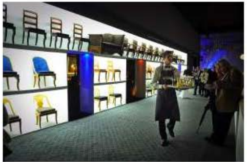
Waiters serve wine to the attendees at the "vernissage," or opening night preview for the press and sponsors, at the 2009 Brussels Antiques and Fine Arts Fair.