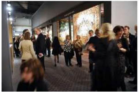
Visitors gather in front of the booth of Galerie Chevalier, Paris, which brought an array of antique and newer tapestries to the 2009 Brussels Antiques and Fine Arts Fair.