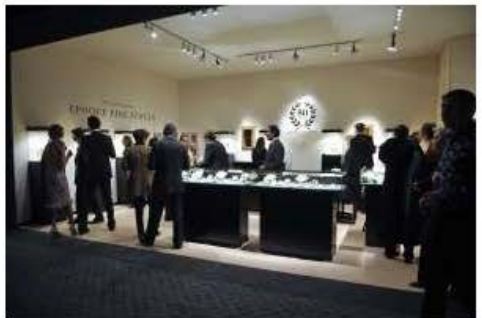
Epoque Fine Jewels of Belgium was promoting its 50th anniversary in business at the 2009 edition of the Brussels Antiques and Fine Arts Fair.