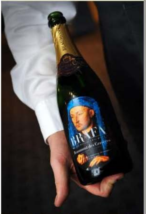
For 2009, the Brussels Antiques and Fine Arts Fair even had its own customized wine bottles.