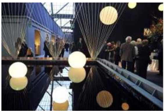
In contrast to the 2008 event, the entrance to the 2009 Brussels Antiques and Fine Arts Fair had a light and airy quality with large globes floating in and above a reflecting pool at the Tour and Taxis facility.