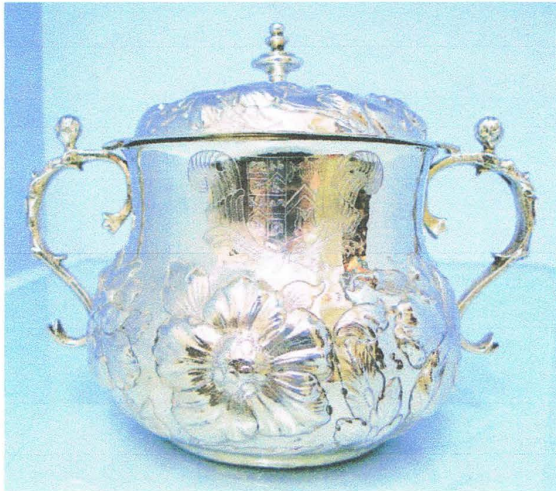
Paul Bennett: This rare and stunning Charles II Porringer and Cover was made in London in 1663. It weighs 37 ounces and is nearly 8.5 inches tall to the top of the finial. The Porringer and Cover boasts attractive floral chasing and an engraved crest.

This takes place at Berkeley Square and among silver and jewellery on offer is: